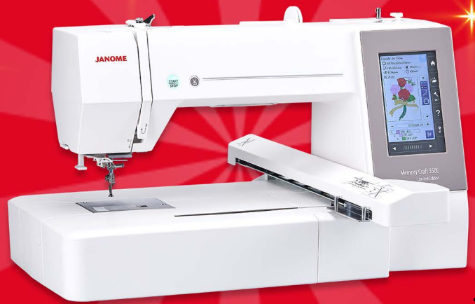
Memory Craft 550E Limited Edition $5499

Sit back, relax and watch your machine conjure the alchemy. Discover dedicated embroidery machines with powerful automated features and innovative technology.