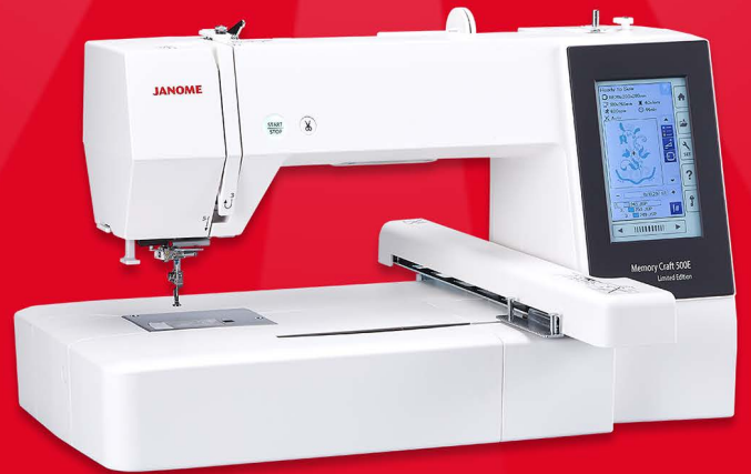
Memory Craft 500E Limited Edition $4499

One of our most popular embroidery only machines. Maximum embroidery size of 200 x 280mm. Designs can be easily imported to the machine via a USB stick.