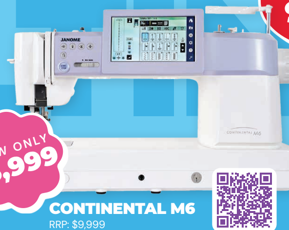
CONTINENTAL M6 RRP: $9,999