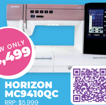
HORIZON MC9410QC RRP: $5,999