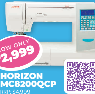
HORIZON MC8200QCP RRP: $4,999