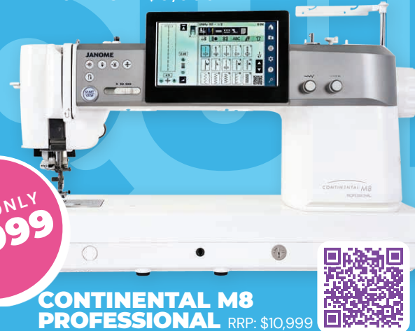
CONTINENTAL M8 PROFESSIONAL RRP: $10,999