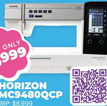
HORIZON MC9480QCP RRP: $8,999