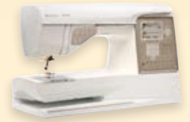
DESIGNER TOPAZ™ 30 DESIGNER TOPAZ™ 20