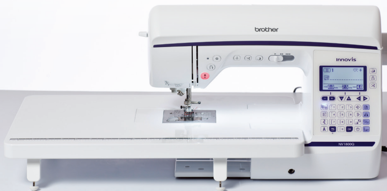
◀ The Innov-is NV1800Q (RRP $1,799)

This is your chance to win over $2400 worth of Brother quilting products that will inspire you to bring your next creative project to life.